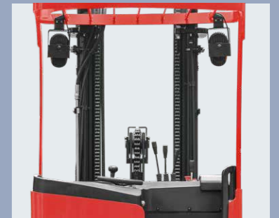
New designed mast and the large open steel roof provide super visibility and safety