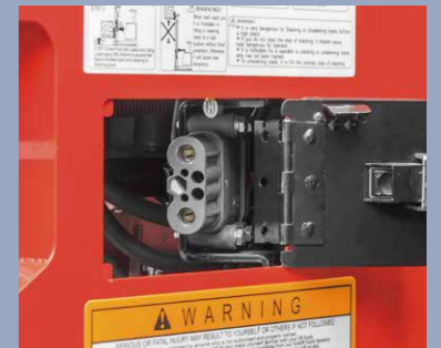
Charging plug inside operator's compartment, this eliminates the need to disconnect the plug from battery, enhancing ease of operation (Std)