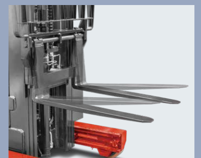
Forks can tilt forward/backward for easy loading