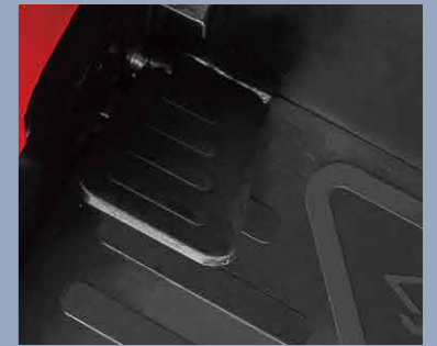
Safe pedal: when the pedal is released, traveling is stopped, and only hydraulic operation is enabled